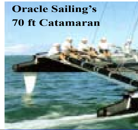
Oracle Sailing's 70 ft Catamaran